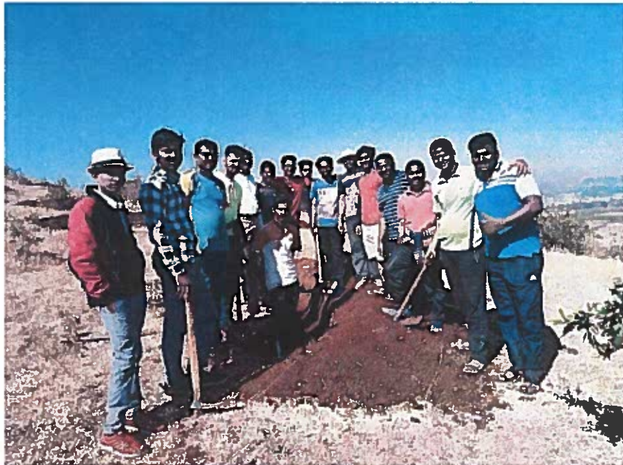
NSS Volunteers along with NSS Coordinator and Area Coordinator of NSS, Nashik