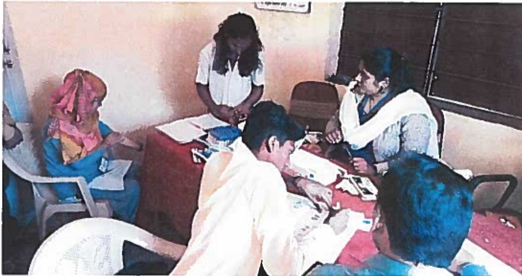
NSS Volunteers along with collected donations for kerala flood relief