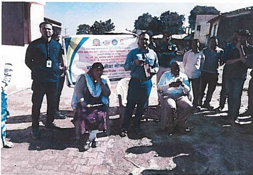
Aids awareness session from team of civil hospital, Trimbakeshwar