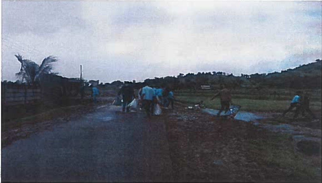
NSS Voluteers cleaned the path during the activity