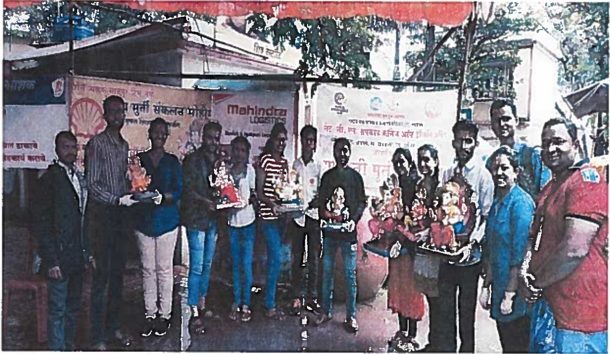
SS Volunteers collected and submitted Ganapati Idols at Someshwar temple location