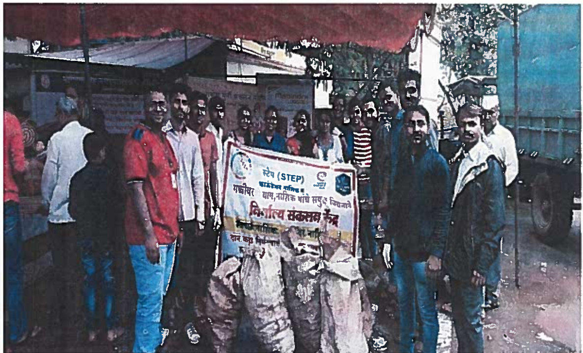
NSS Volunteers collected and submitted nirmalya at Someshwar temple location