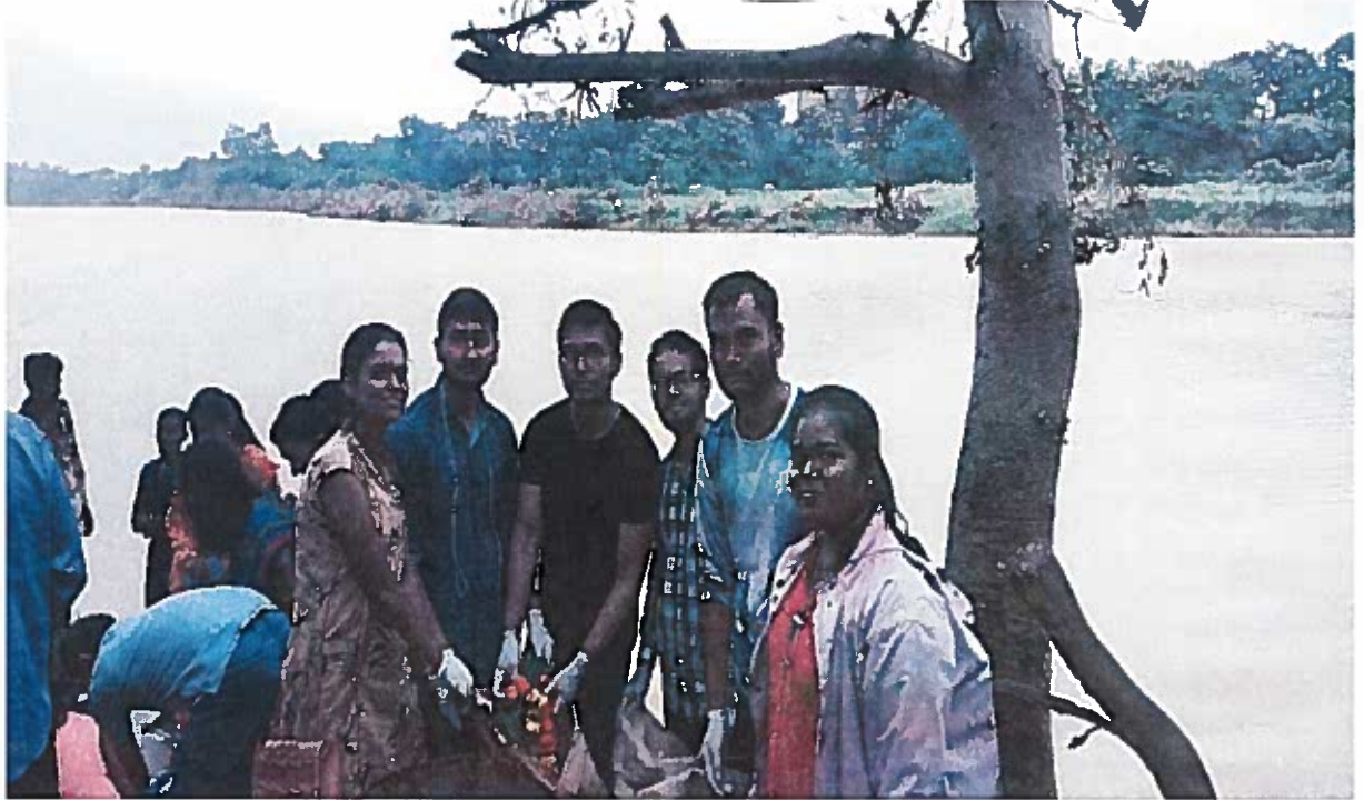
NSS Volunteers collecting nirmalya at Navshya Ganpati temple location