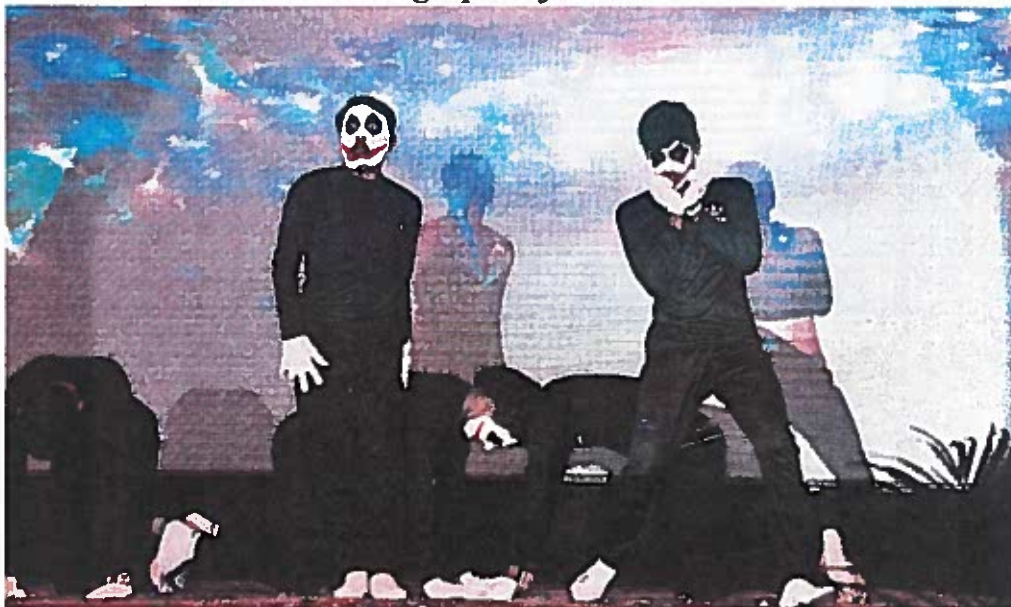
NSS Volunteers amusing the crowd during the act on road safety