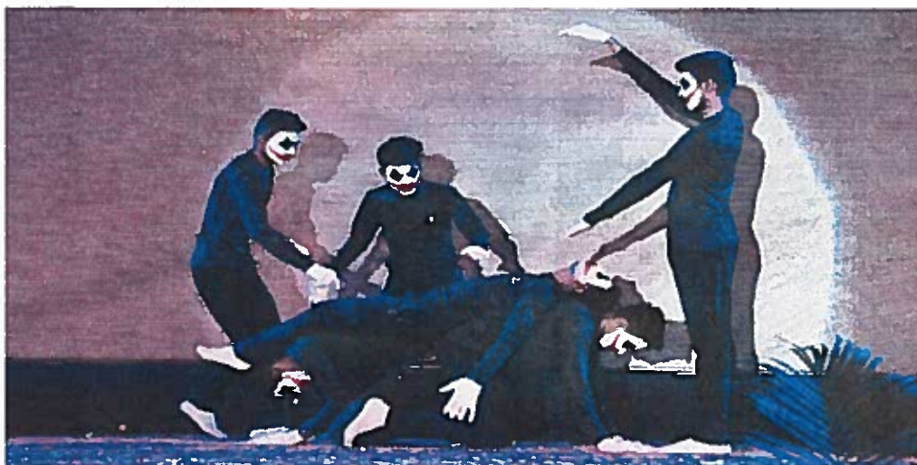
A scene of road accident from the mine act