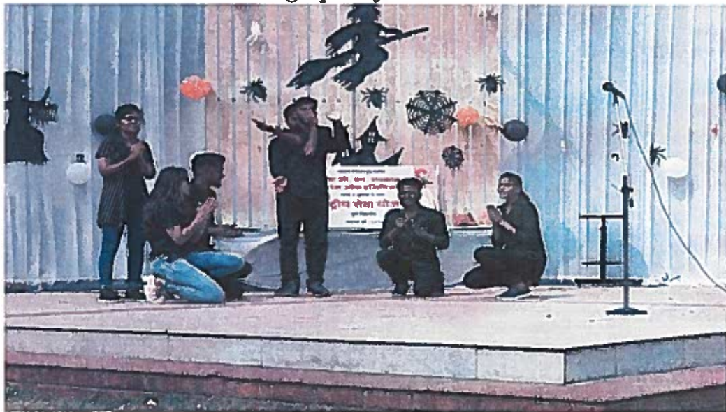
NSS Volunteers performing the street play act