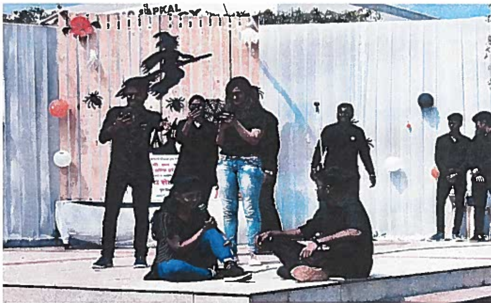
A Scene from NSS Volunteers act