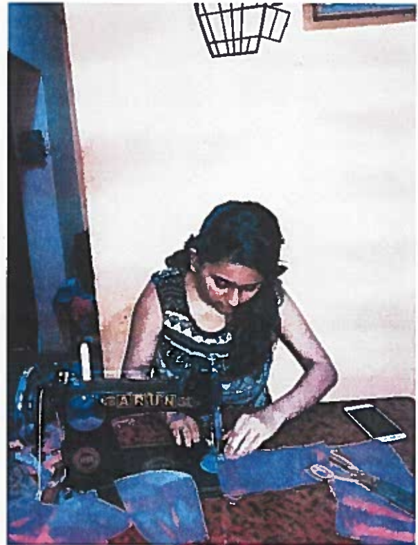
Volunteers using sewing machine to manufacture masks