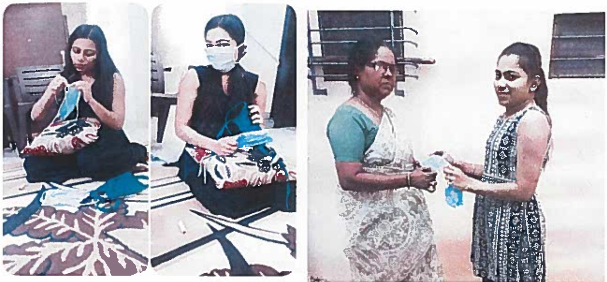
NSS Volunteers hand stitched masks and distributing them