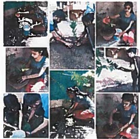
Harit Wari Activity (Tree Plantation) by NSS Volunteers and staff