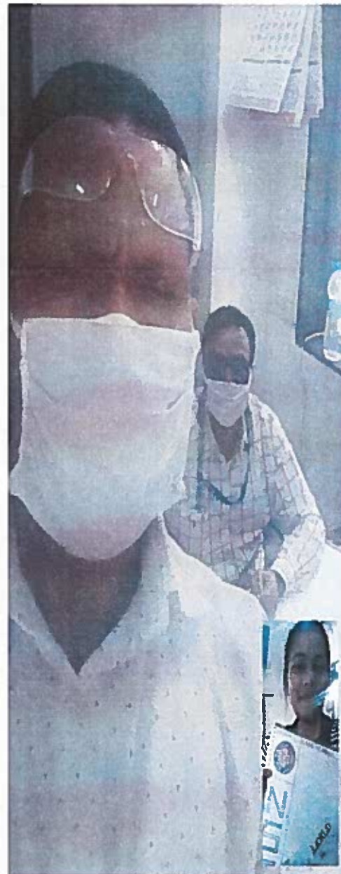
Swasth Wari Activities by NSS Volunteers offline and online mode