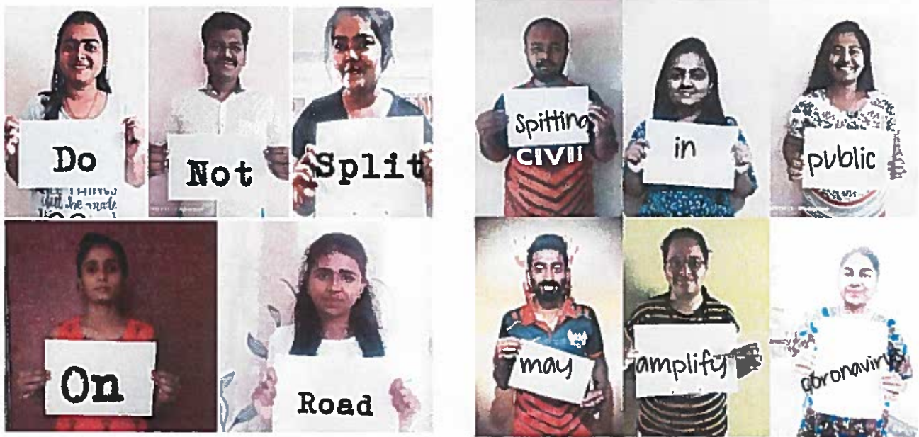
Nirmal Wari (ODF & No Spitting) activities by NSS Volunteers