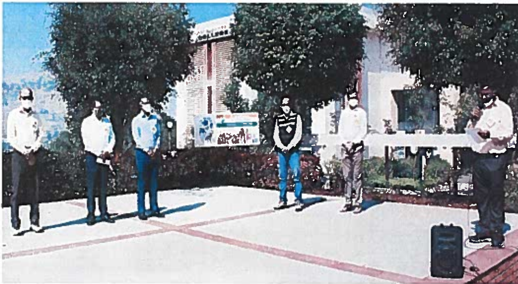
Honorable guest from Tahsil office Trimbakeshwar and institute