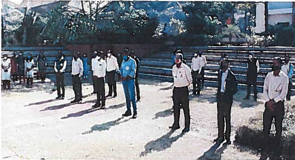
Program was conducted at amphitheatre