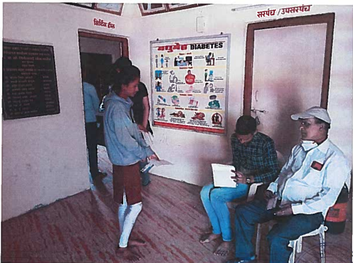
Student volunteers at registration desk for eye checkup