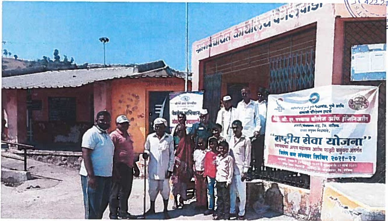
Senior citizens along with children at villagers at Eye check-up camp