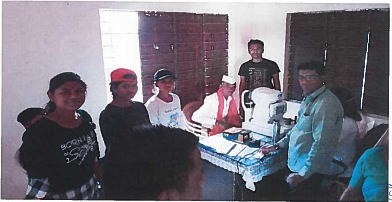
Volunteers helping facilitating villagers and technicians at eye check-up desk