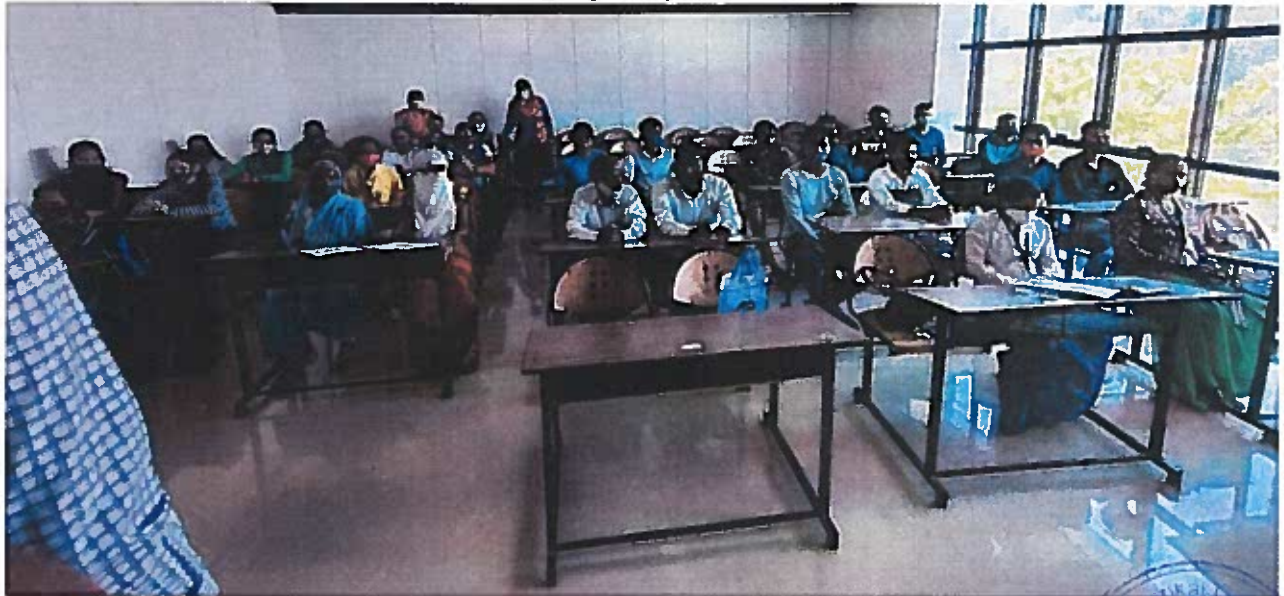
Beneficiaries of the Mission Yuva Swasth