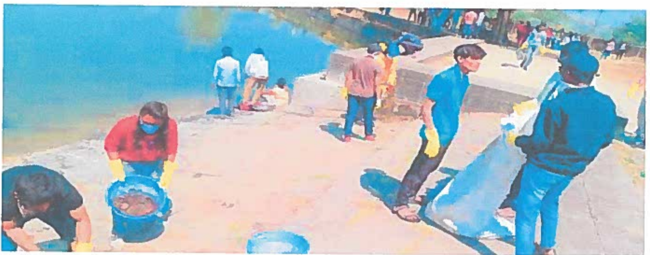
Student cleaning the Water Reservoirs