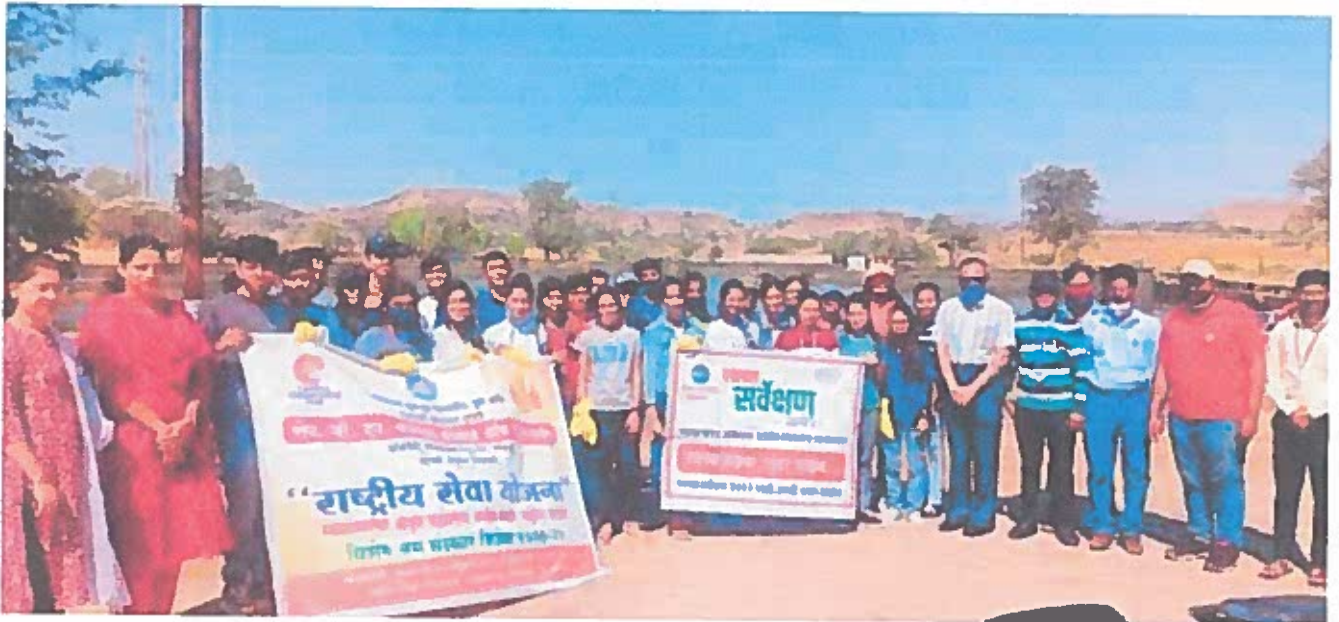
NSS Student volunteers along with Trimbakeshwar Nagar Parishad officials