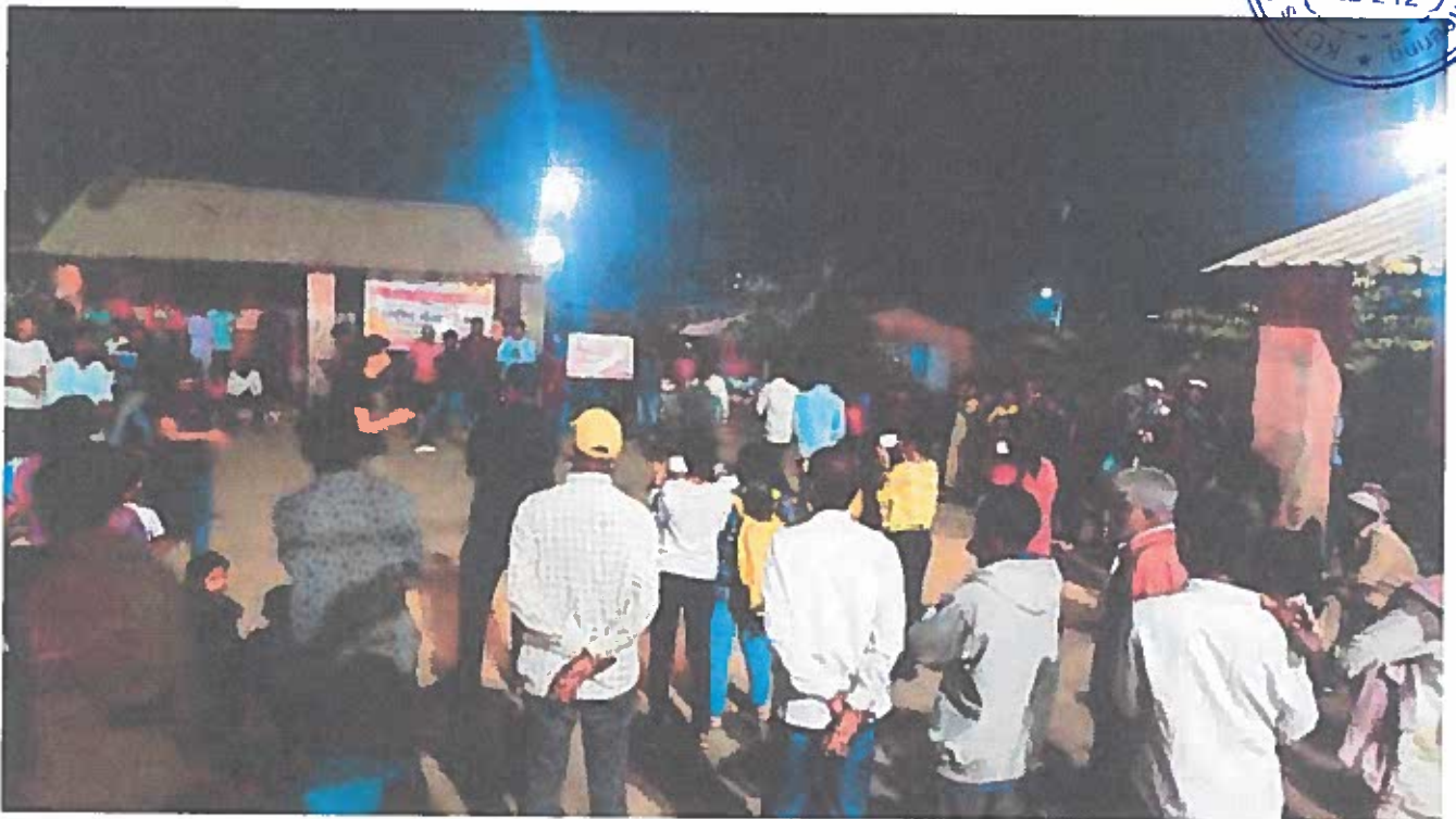
Villagers including children's at street play