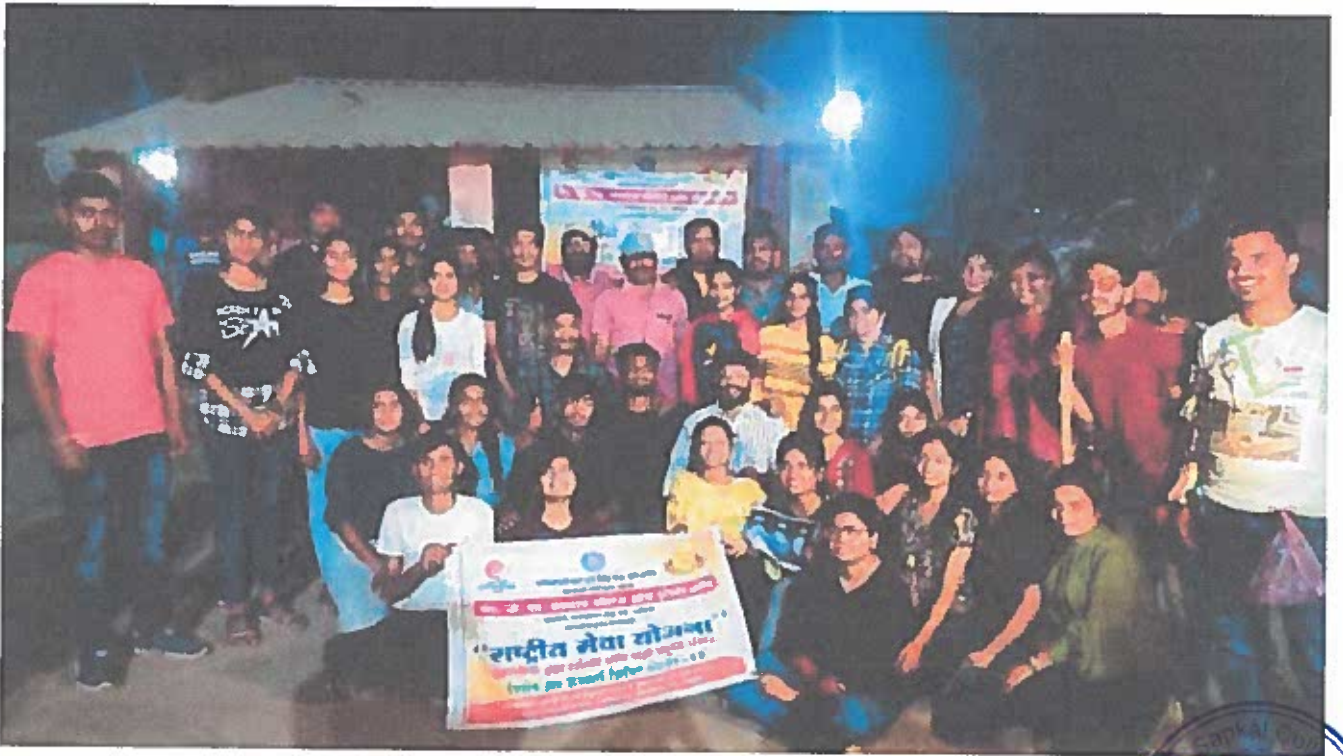
Street play team on swachh bharat awareness