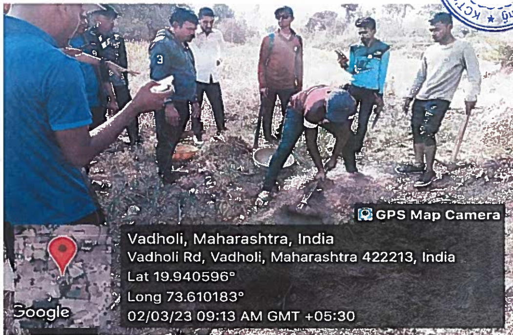
NSS Volunteers digging the pit for septic tank at wadholi village