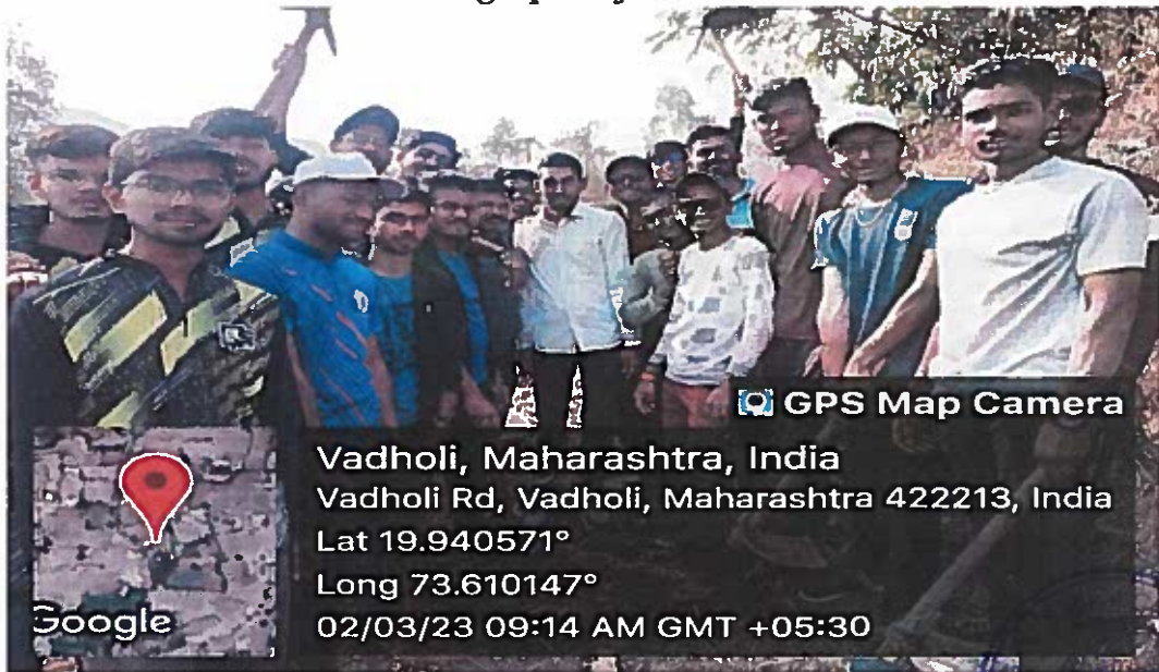
NSS Volunteers with villagers at pit digging of for septic tank