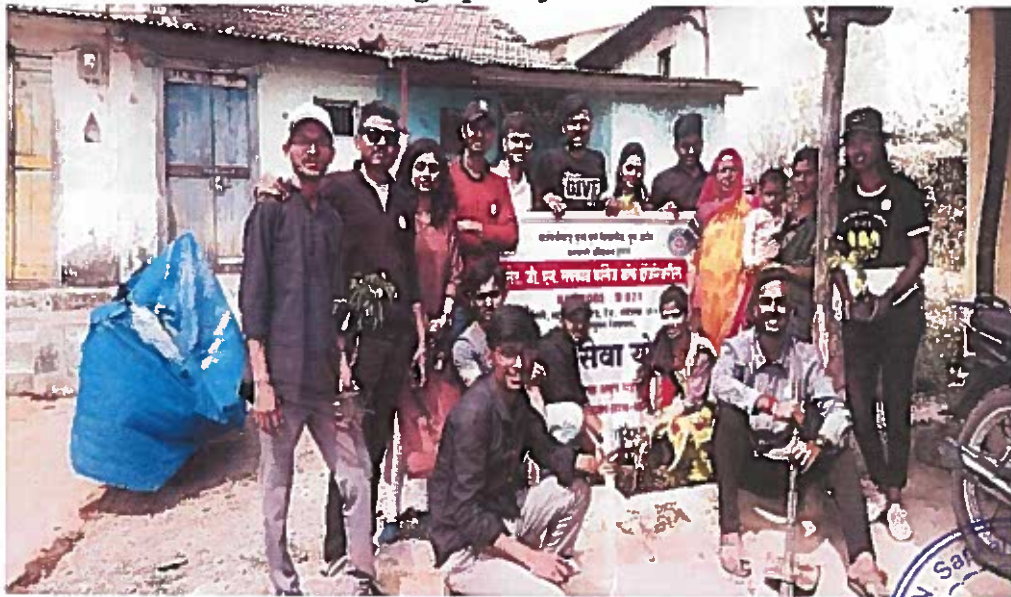
Tree plantation by volunteers and villagers.