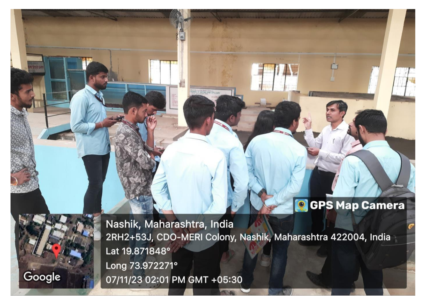
Model Testing Division