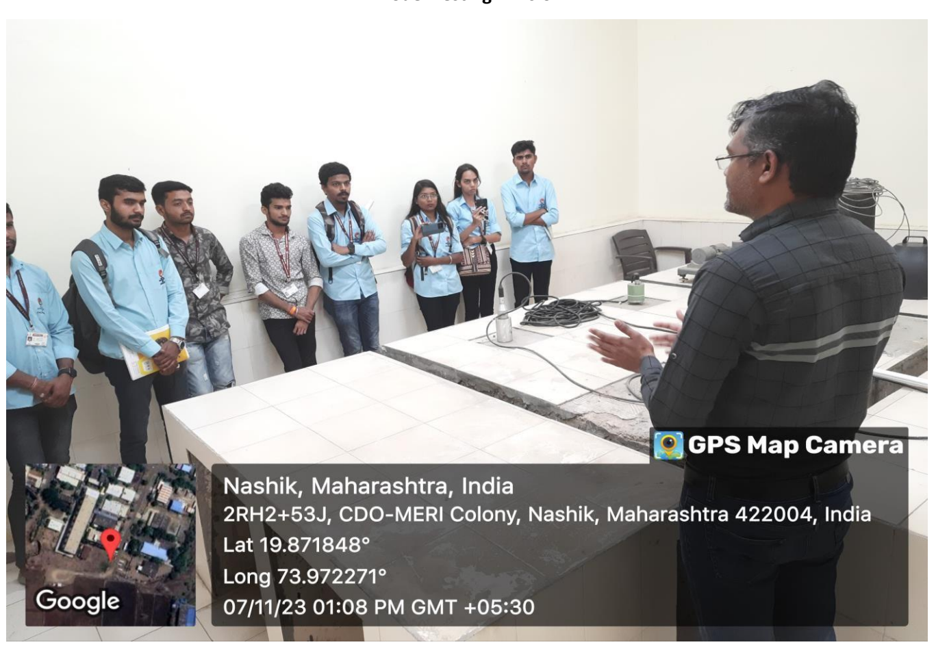
seismic data collection, analysis and maintenance division