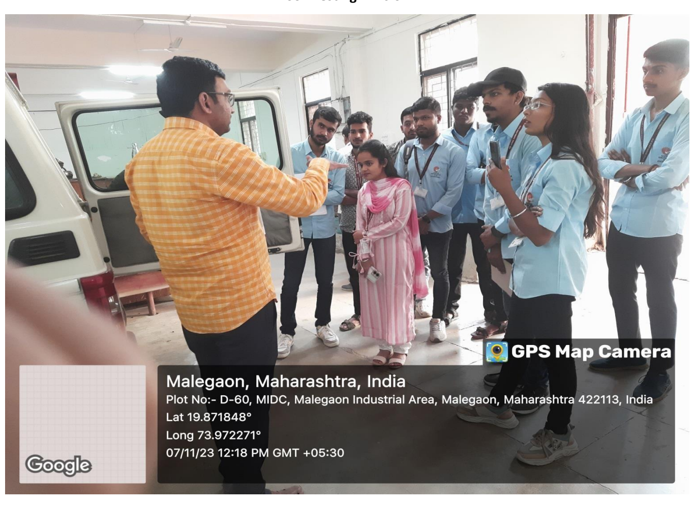
Highway Research Division