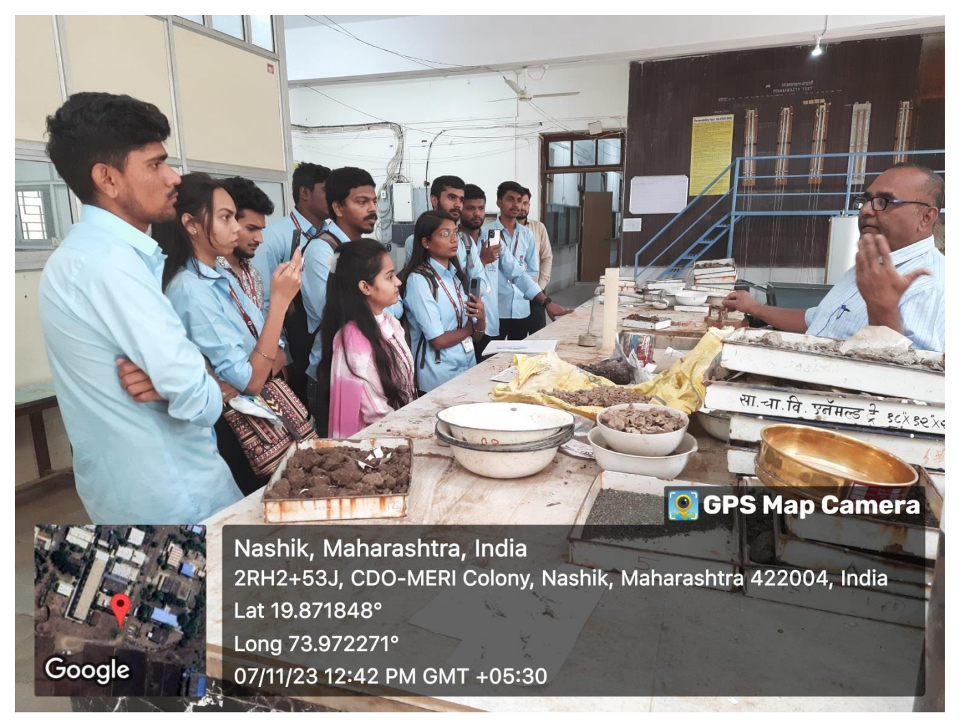
Soil Testing Division