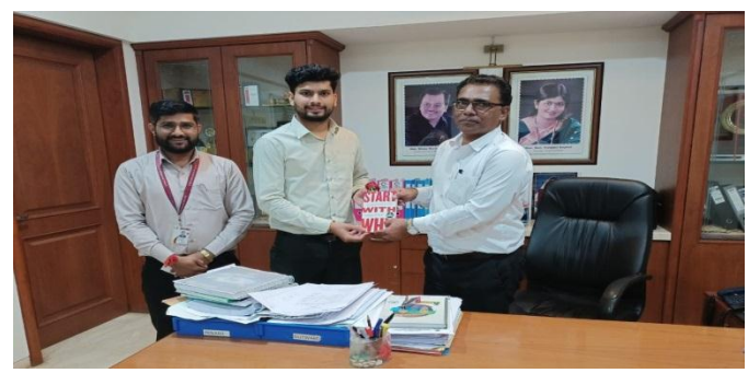
Figure 1 Felicitation of Chief Guests