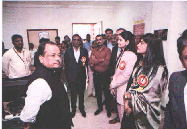
Discussion with Participants