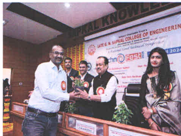
Felicitation of Judge