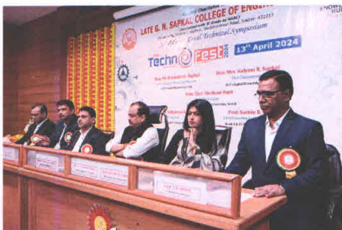
Welcome Speech by Principal