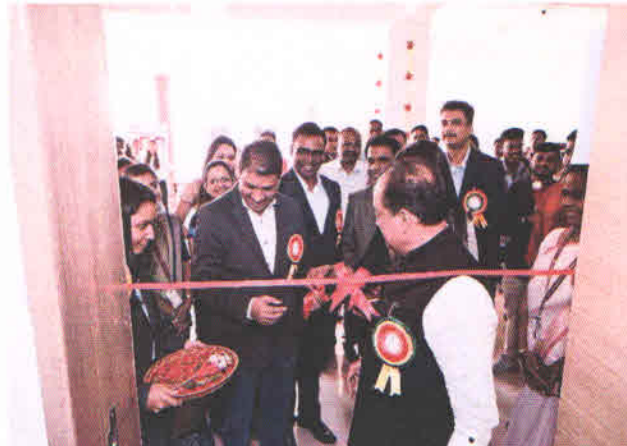
Inauguration of the Event